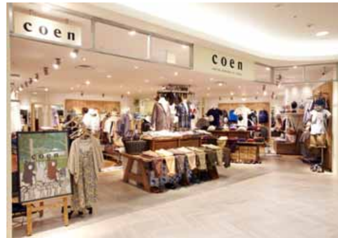
COEN Futakotamagawa Dogwood Plaza