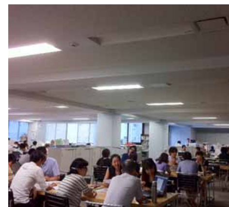
Reduction in the number of lights used in offices

Sales price including taxes: ¥945 50% of sales proceeds donated