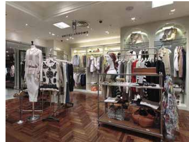
UA DAIMARU KOBE WOMEN'S STORE